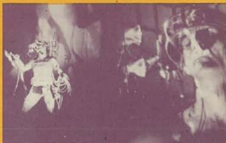
Stelarc Video Shadow, Automatic Arm and Third Hand 1991

A spectacular performance event that extends the artist's body through an interactive network of biosensors, control mechanisms and robotics. Utilising data gloves and head-mounted display, hand and motion gestures control a complex interplay of sonics, physical presence, virtual and video imagery.